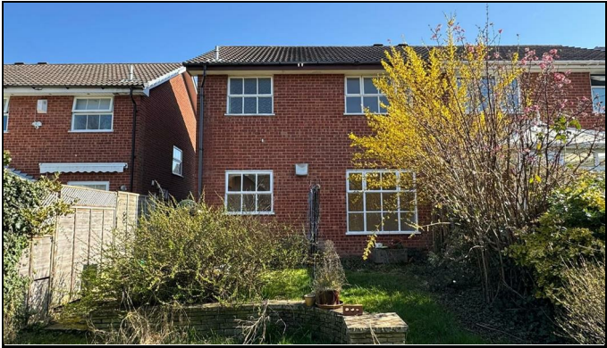
Old Fordrove, Sutton Coldfield, B76 1AQ